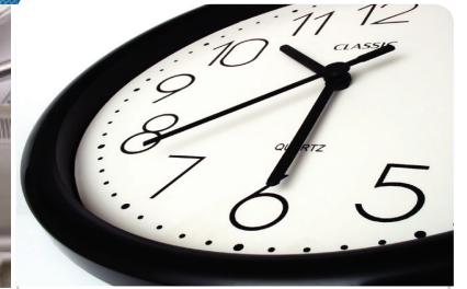
Claims Processing Within 24Hours of Receiving Super Bill