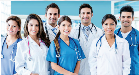
Increased Staff Efficiency Better Productivity

MMS Coding Teams Are: Convenient access to a coding team you can prevent errors, Flexible: Our teams are customized to your practice needs. We can take on full or partial department outsourcing, become a fill-in program for short and long term leaves. Risk-Free: There is no cost to set up a coding team